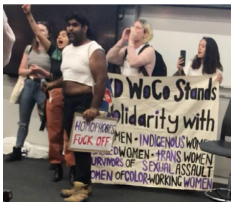
Misguided protestors at the University of Sydney Event that preceded the complaint to Council against FLC

As a direct result of this action by the City of Sydney, NSW Legal Aid has now threatened to remove us from all legal aid panels and court rosters and to reassign our existing cases. We are certainly challenging this and are now receiving pro bono legal support from counsel with expertise in human rights and defamation law.