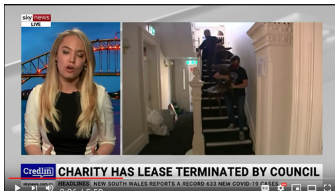
Sky News covering Feminist Legal Clinic volunteers packing up the office

Last-minute bid to save women's charity from eviction , Sky News, 18 August 2021