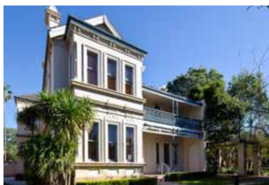
Benledi House, Glebe

Finally, despite our deep disappointment with the recent decision by the City of Sydney Council to terminate our tenancy in Benledi House Glebe, we would like to thank them for providing us with a free office space for the past four years. It was much appreciated by our volunteers and clients alike while it lasted.