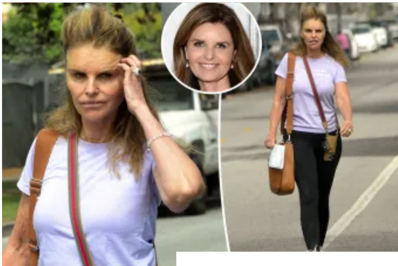
Maria Shriver looks unrecognizable while visiting